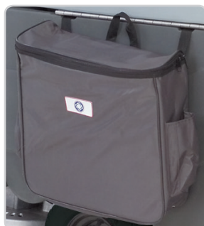
Onboard Tote Bag