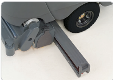
Cylindrical scrub decks sweep and scrub in a single pass with dual counter-rotating brushes. Polyethylene hopper eliminates corrosion.