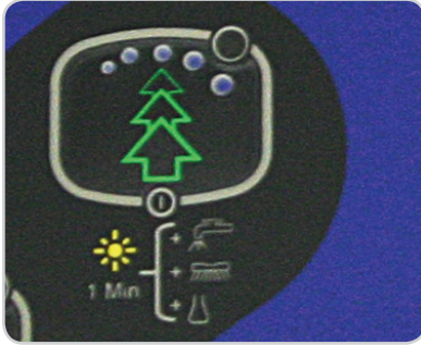
EcoFlex™ System has One-Touch™ activation for an on-demand cleaning burst of power.