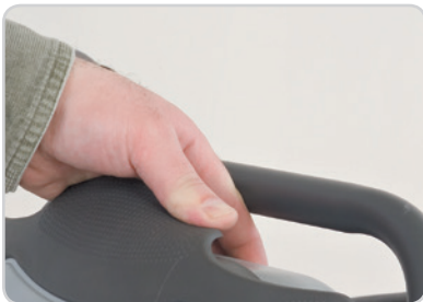
Soft-Touch™ Paddle System prevents finger pinching, provides maximum control, reduces repetitive-stress injuries, and prevents the operator from being pinned between the machine and an obstruction.