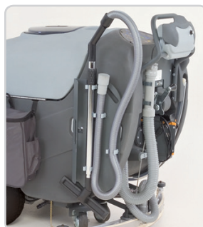
Onboard Scrub-Vac System

9435 Winnetka Avenue North Brooklyn Park, MN 55445 www.advance-us.com Phone 800-850-5559 Fax 800-989-6566