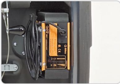
Standard onboard battery charger for wet or gel battery packages.